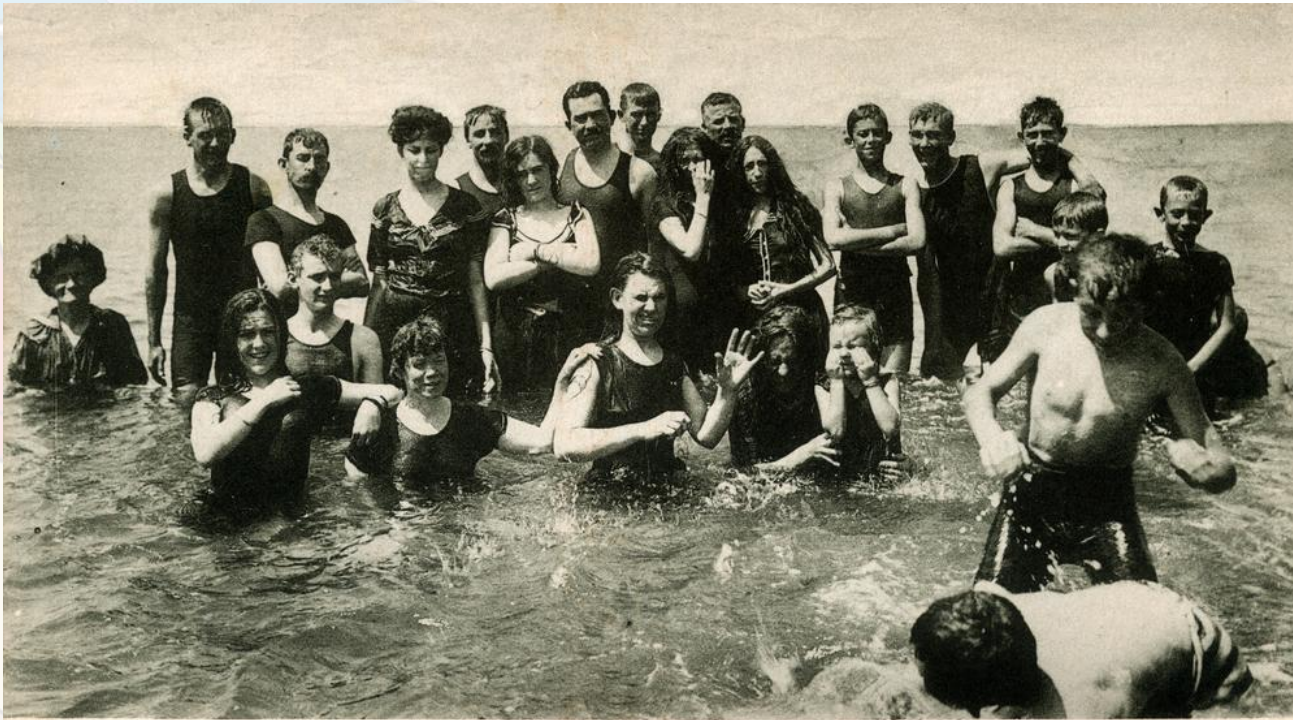
Mixed Bathing, Redcliffe, Qld.

Sunbathing wasn't in fashion back then, so Victorians would go to the beach fully clothed. 'Sea bathing' was done instead.