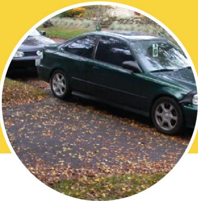
Parking over driveways