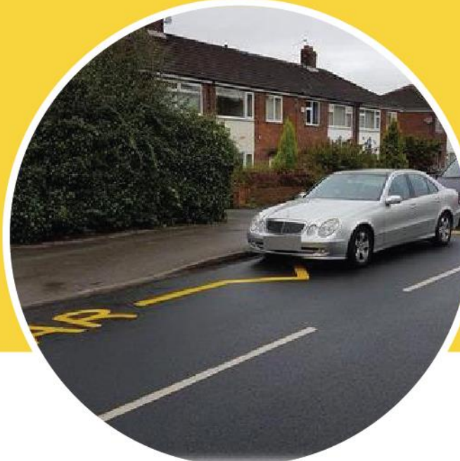
Parking on the School Keep Clear Marking (Zig Zags) This includes stopping and dropping off