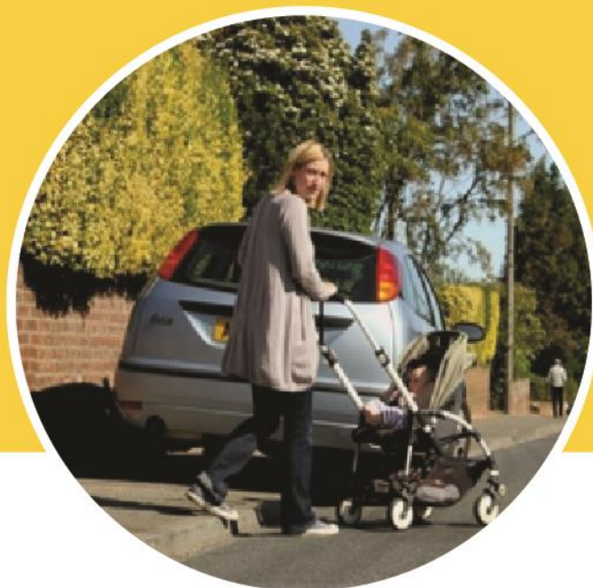
Parking on the pavement