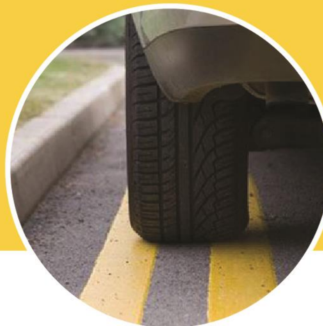
Parking on restrictions